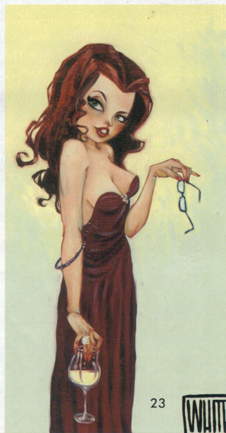
Right: "Craving For You" Fine Art Limited Edition, 16" x 28"